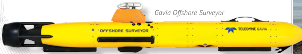
Gavia Offshore Surveyor