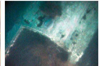
Detail of bottom hatch from the Gavia camera system.