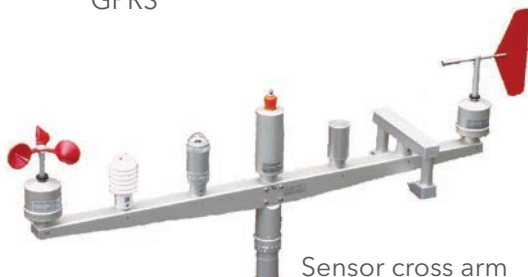
Sensor cross arm